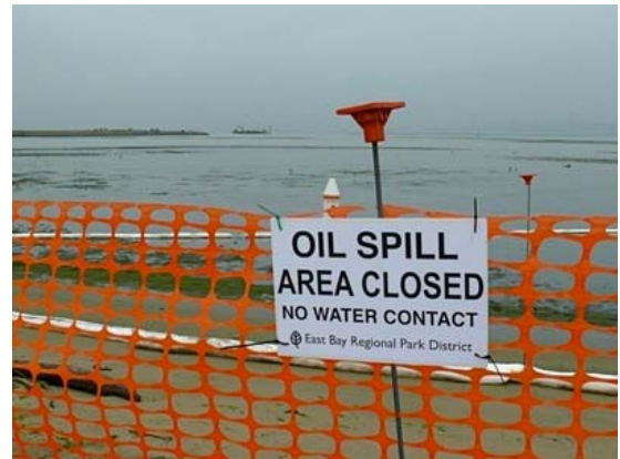
This could this be Sarasota if Florida Legislature approves coastal oil drilling.

If you care about Sarasota County and its neighborhoods, please forward this newsletter to your email list!